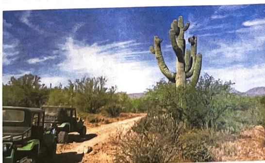
Impressive cacti greet visitors on the Green Zebra Desert Jeep Tour, which includes stops for information about the vegetation by the lead-vehicle guide.

F rom Tempe and Sun City to Chandler and Maryvale, the Milwaukee Brewers and their fans have spent spring training in the Phoenix area for nearly 50 years. After nearly a half century of Cactus League travel, faithful followers from Wisconsin have fewer and fewer “hidden gems” to discover. ■ One such place is the We-Ko-Pa Resort & Conference Center, part of the Fort McDowell Yavapai Nation, northeast of Scottsdale. ■ We-Ko-Pa boasts resort amenities at hotel prices, a casino, golf courses, private-trail jeep tours, Segway tours and horseback riding in the Sonoran Desert, Verde River kayaking, and riverboat cruises across Saguaro Lake. ■ The American Indian-owned We-Ko-Pa Resort is Yavapai for four peaks and refers to the sacred Four Peaks mountains on the 28,000-acre reservation. ■ Despite its tranquil locale, the resort is easy to reach off Arizona State Highway 87 within a 30-minute drive of Phoenix’s Sky Harbor International Airport. See ARIZONA, Page 7E