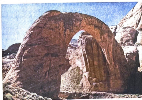
Rainbow Bridge National Monument viewed from the front. STEVE SLOSAREK

A tranquil, 1.5-mile roundtrip hike along a winding trail through the canyon puts visitors in an anticipatory state of mind when, suddenly around a bend, the spectacular arched bridge reveals itself.