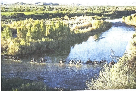
Trail rides through private acres of the Sonoran desert include crossing the Verde River. WE-KO-PA RESORT & CONFERENCE CENTER