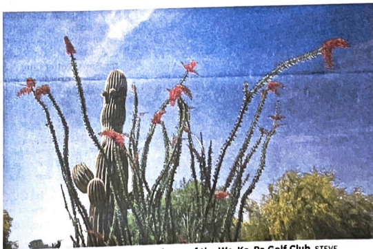
Flowers and cacti are part of the charm of the We-Ko-Pa Golf Club.

Even if they end up losing in the casino, Cactus League-goers can say they found a winning destination.