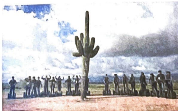
Segway tours through private acres of the Sonoran desert have risen in popularity among We-Ko-Pa Resort guests.

tion in We-Ko-Pa Resort. More information: The We-Ko-Pa Resort & Conference Center is at 10438 N. Fort McDowell Road, Fort McDowell, Ariz. For more, call (480) 789-5300 or see wekoparesortandconferencecenter.com .