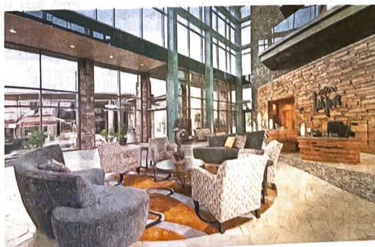
The lobby of the We-Ko-Pa Resort & Conference Center, just northeast of Scottsdale.