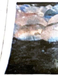
Ice orbs will be on

M te Ne Fa wi thr itor ing, race mus wint Ea Ski ing E host t can Sk Comb ships day at Hill. B vance a kids 12 free. skiclub. Elkha Days. C during t day thro Activitie hart Lak Show at t lage Th snowshoe ice skating and music SK costum ding and next S schneeday